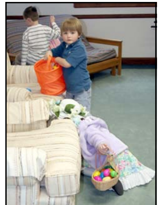
Captions on facing page.